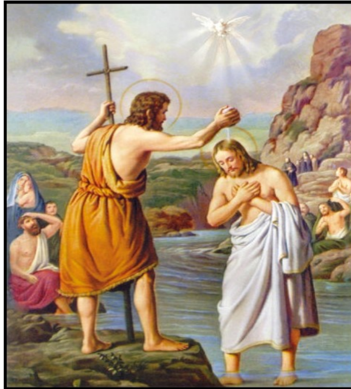
The Baptism of the Lord